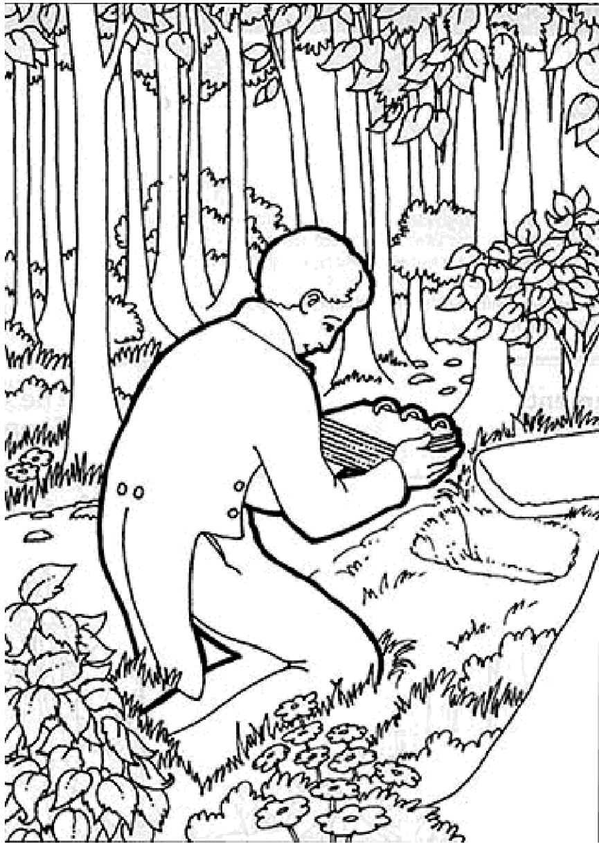
"Joseph Smith Receives the Gold Plates," Friend, Dec. 1998, 9 The Prophet Joseph Smith was born in December. The Lord restored His church through this mighty Latter-day prophet. In this picture for you to color, he is getting the gold plates, the translation of which became the Book of Mormon.